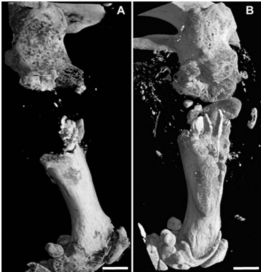
Figure 2. Micro-CT images of murine segmental femur (5 mm) defects at 4 weeks post operation. (A) Represents a control segmental femur defect, (B) represents encapsulated VEGF and BMP-2 in a composite alginate / Poly (D-L) lactic acid scaffold with seeded HBMSC implanted within the femur defect. Bar = 1.5 mm.

osseous defects. Whereas, load-bearing BMP-2 scaffolds can maintain bone length and enhance regeneration of bone in a critical sized defect (Chu et al. , 2007). BMP-2 and TGF- \beta 3, combined with RGD-alginate hydrogel co-delivered to critical sized femoral defects (8mm) within polymer scaffolds showed an increase in bone formation (Oest et al. , 2007).